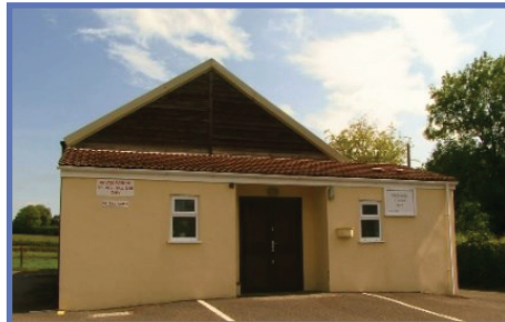
The village hall in the 1970s...and today

The Anniversary Dinner for the Village Hall was a wonderful night full of great memories.